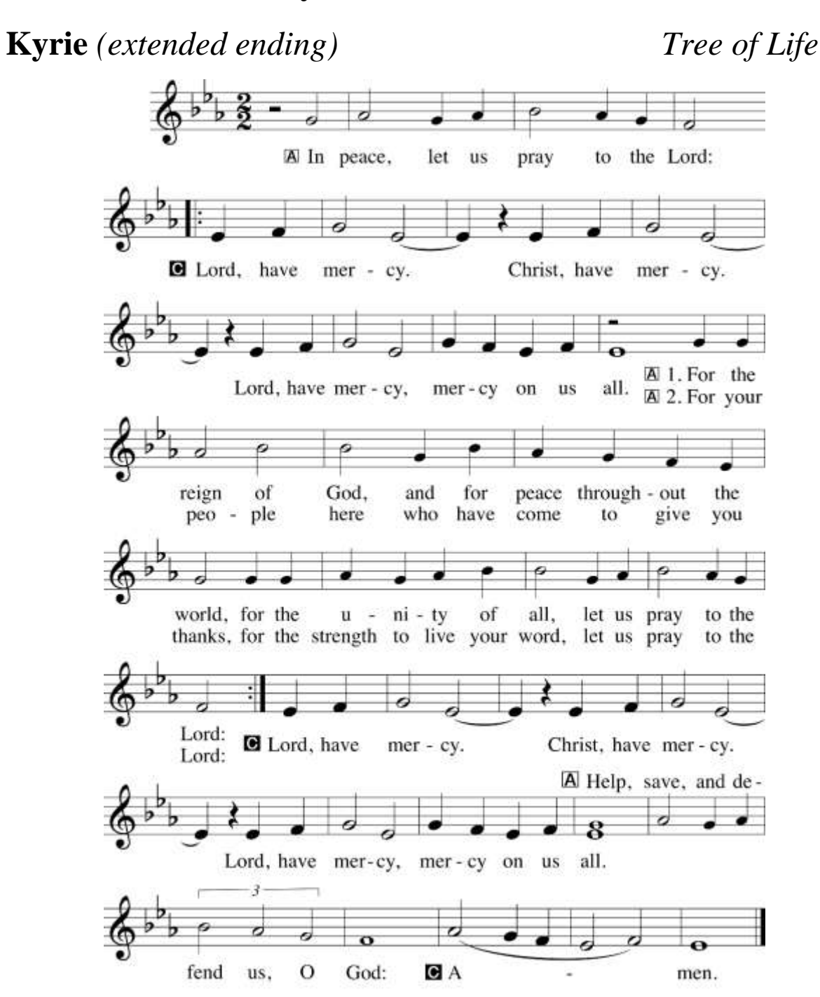
Text: Marty Haugen and Susan Briehl; © 2000. GIA Publications, Inc. Music: Marty Haugen; © 2000, GIA Publications, Inc.