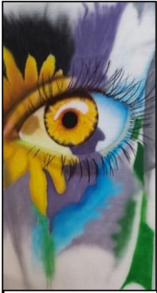
Deepen Faith and Witness

The annual Assembly and Theological Conference of the Montana Synod of the ELCA will be held June 3-5, 2016, at the Radisson Hotel Billings (formerly the Holiday Inn Grand.)